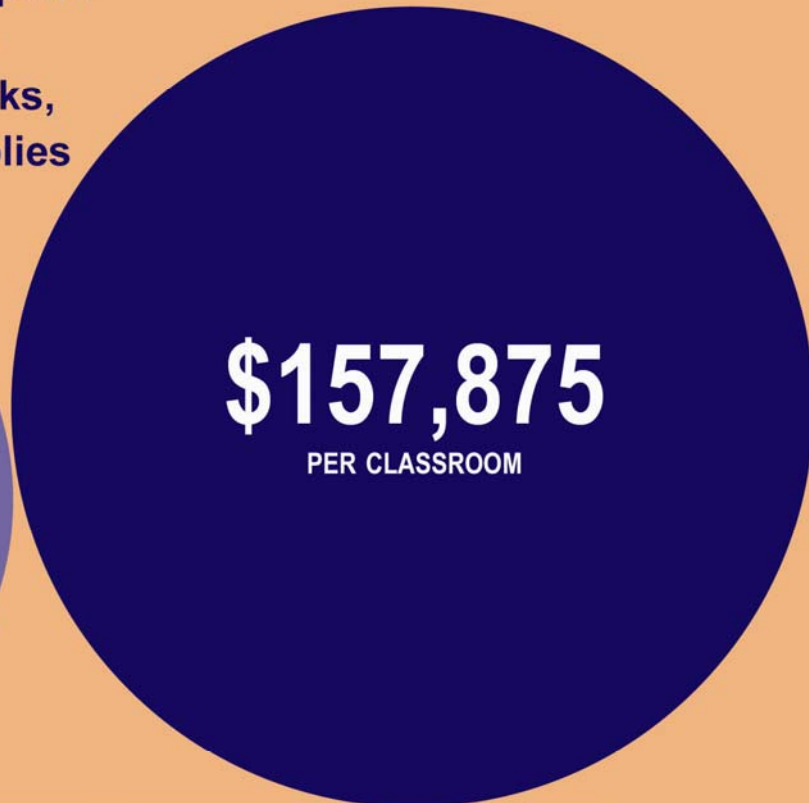
Richest 100 school districts