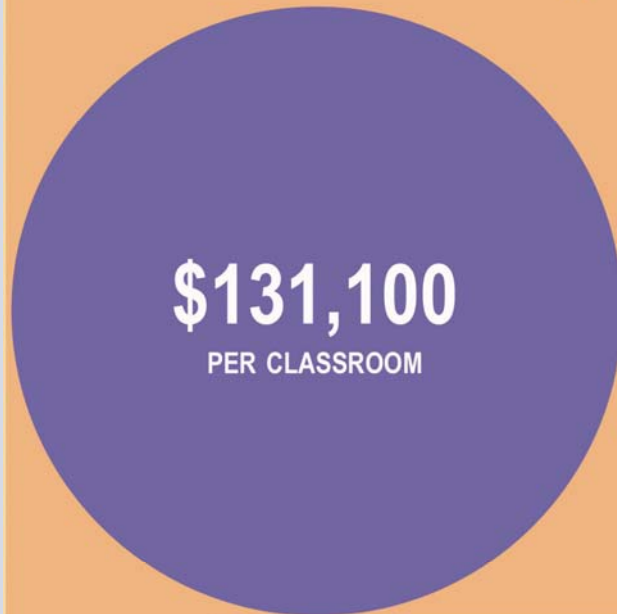
Poorest 100 school districts

The 100 richest school districts will have $26,775 more to spend per classroom on teachers, curriculum, books, technology tools and supplies