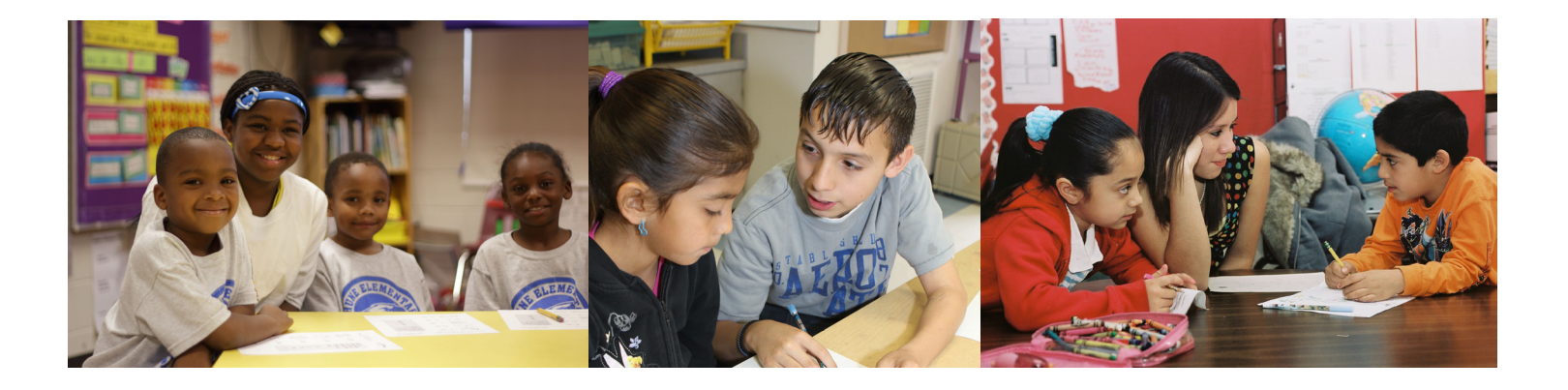
The IDRA Valued Youth Partnership is a research-based, internationally-recognized dropout prevention program that has kept 98% of its tutors in school.

The Valued Youth Partnership, created by IDRA, is an internationally-recognized, cross-age tutoring program with an unusual twist. This dropout prevention program works by identifying junior high and high school students in at-risk situations and enlisting them as tutors for elementary school youngsters who are also struggling in school. Given this role of personal and academic responsibility, the Valued Youth tutors learn self-discipline and develop self-esteem. Schools shift to the philosophy and practices of valuing students considered at-risk. Results show that tutors stay in school, have increased academic performance, improved school attendance and advanced to higher education.