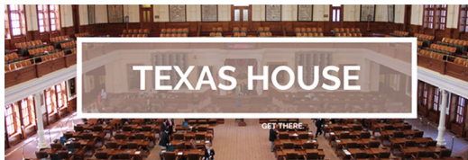
House Floor Proceedings

Texas Special Session Alert Texas Should Not Throw Away $500 Million