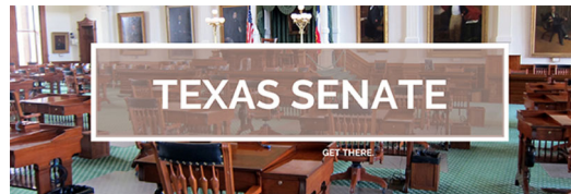
Senate Floor Proceedings